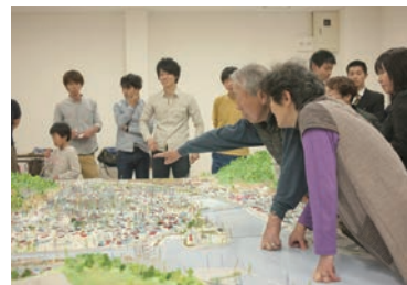
LOST HOMES PROJECT [Japan]