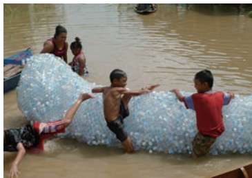
THAI THAI DAIJOBUI [Thai]